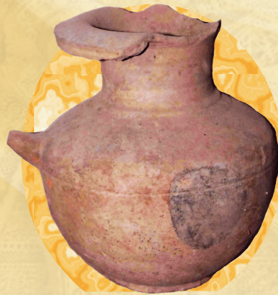
Pottery from Gupta Ages, 2000 yr. old