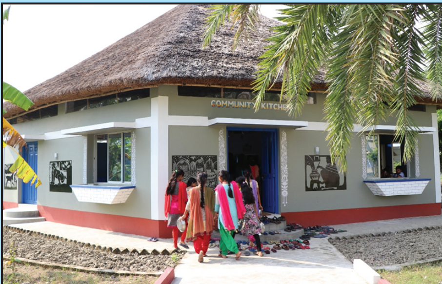
The Community Kitchen-cum-Dining Hall of JGVK