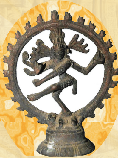
Nataraj (Kushan Age) 2500 yr old