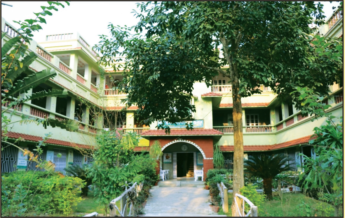
Administrative-cum-Training-cum-Hotel Building of JGVK