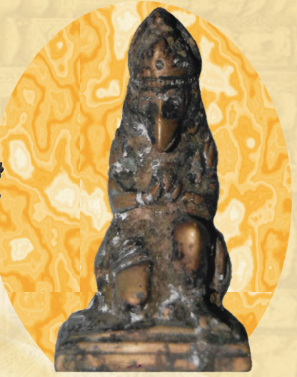
Gorur, Bronze (Gupta Age) 2000 yr old