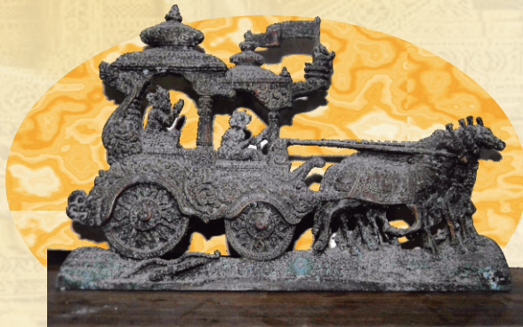
Partha Sarathi, from the British Period