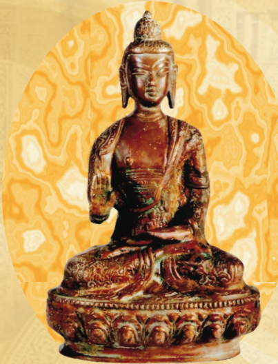
Buddha Murti (Mourya Age) 2500 yr old