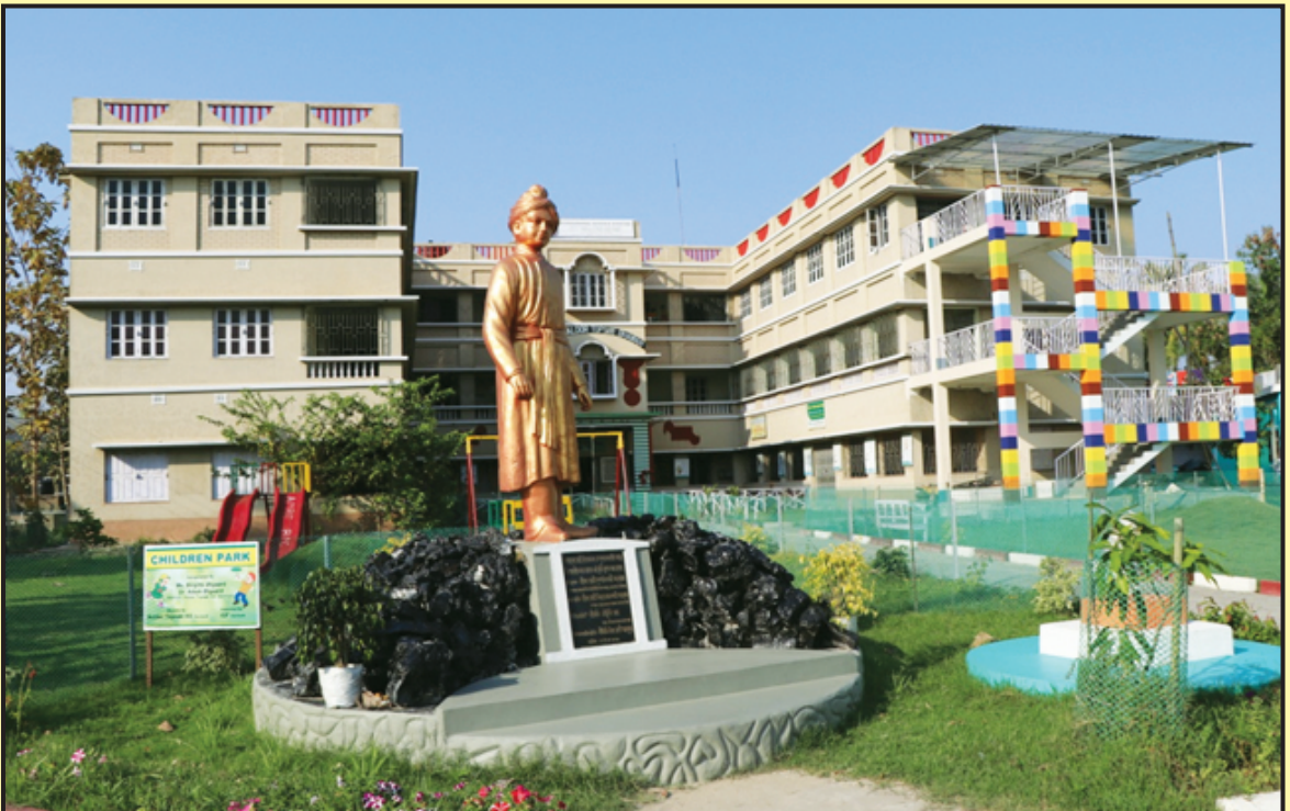
Vivekananda Shiksha Niketan (VSN) – High School of JGVK