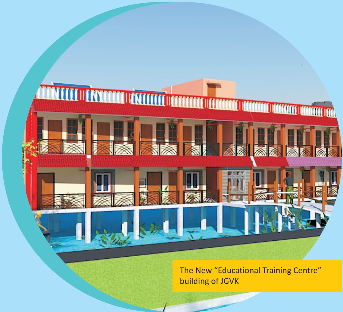
The New “Educational Training Centre” building of JGVK