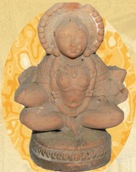
Brahatarasana (Pal Age) 1500yr old